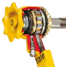
Optional: Overload protection for D95 and C/D85.

Since 1936 more than 1 million units have been built in Velbert.